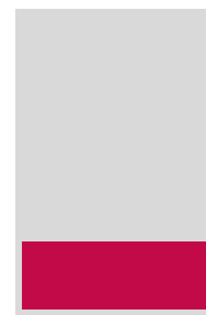
1/4 page - wide 266 x 90 mm