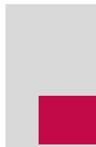
1/4 page - wide 198 x 135 mm