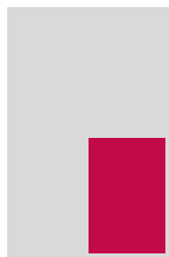
1/4 page - high 131 x 180 mm